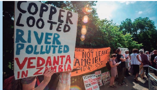
Foil Vedanta protest

One of the most high profile of these was brought against Vedanta Resources Plc and KCM Plc, its Zambian subsidiary, by a group of 1826 Zambian villagers who claim to have suffered as a result of toxic discharges from one of the world's largest copper mines. They allege that Vedanta, the UK parent company, owed a duty of care to them because it exercised control over KCM's operations in Zambia.